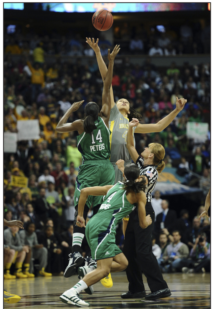
The 2012 Women's Final Four featured four No. 1 seeds in Baylor, Notre Dame, Stanford and UConn.