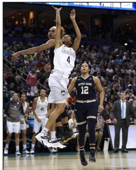
Moriah Jefferson (4) helped lead UConn to four consecutive national titles from 2013-16.

0—Auburn, 1989 0—Tennessee, 1989 1—Louisiana Tech, 1988 1—Tennessee, 1991 2—Louisiana Tech, 1994 2—Baylor, 2019