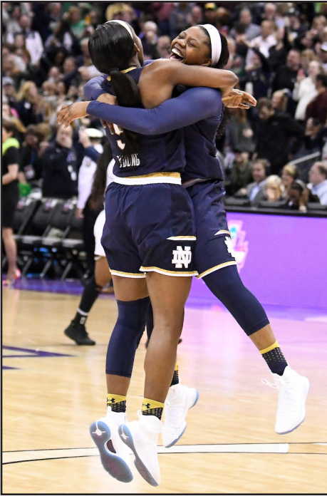
Notre Dame's Arike Ogunbowale celebrates following the 2018 national championship game in Columbus, Ohio.