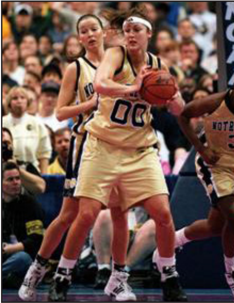
Ruth Riley (00) led Notre Dame to the 2001 national championship.