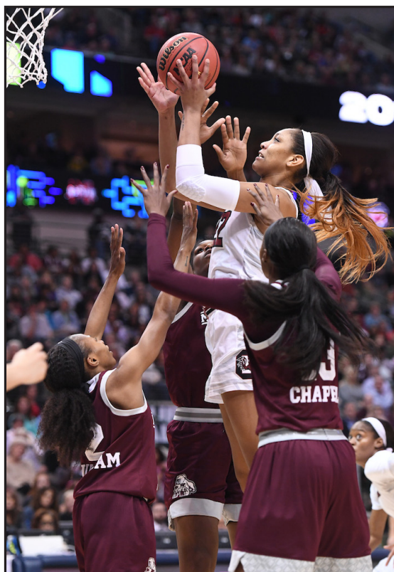
A'ja Wilson of South Carolina captured 29 rebounds during the 2017 Women's Final Four.