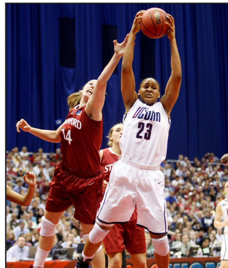
UConn's Maya Moore won the Women's Final Four Most Outstanding Player award, after scoring 57 points and grabbing 23 rebounds in the two games in 2010.