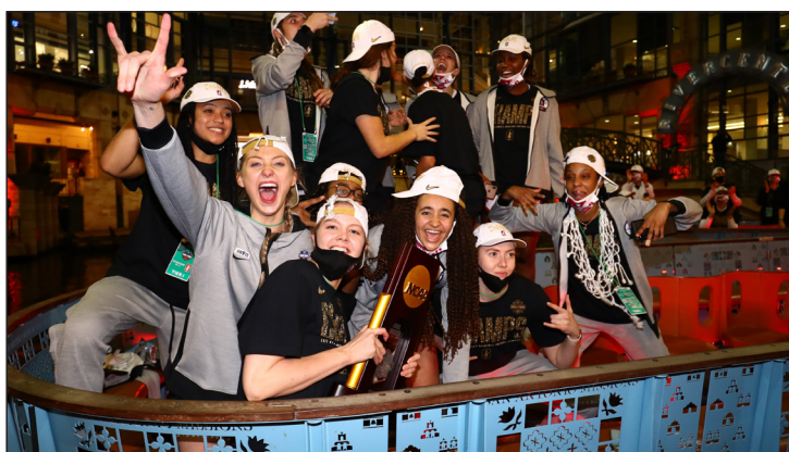
The Stanford Cardinal celebrate their 2021 national championship with a victory lap on the River Walk in San Antonio.