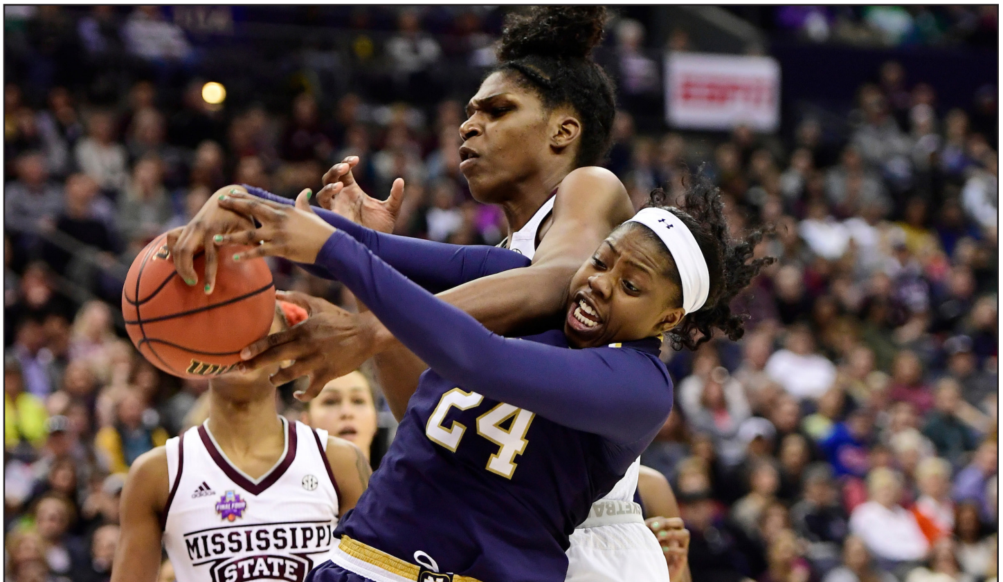
Arike Ogunbowale of Notre Dame and Teaira McCowan of Mississippi State fight for a rebound during the championship game of the 2018 NCAA Women's Final Four.