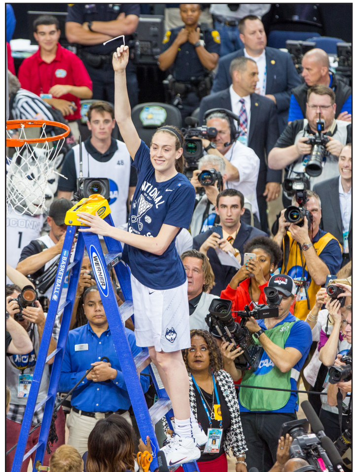
UConn's Breanna Stewart became the first player in tournament history to earn four Women's Final Four Most Outstanding Player awards.

Jennifer Rizzotti, UConn Saudia Roundtree, Georgia Kate Starbird, Stanford Chamique Holdsclaw, Tennessee