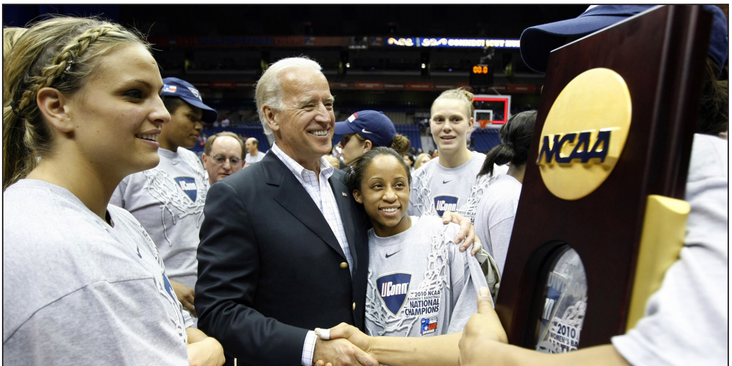
President Joe Biden, vice president at the time, was on hand to congratulate both teams following the 2010 national championship game in San Antonio.