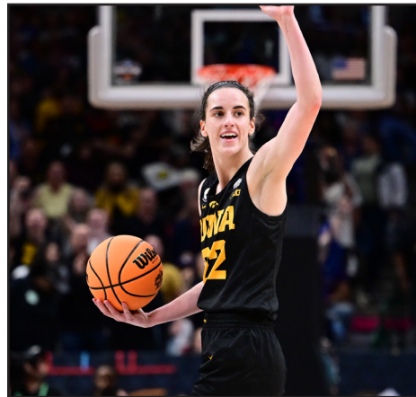
Iowa's Caitlin Clark celebrates after the Hawkeyes bested the South Carolina Gamecocks during the 2023 Women's Final Four.

32—Western Ky. vs. Missouri St., 4-4-92 31—Louisiana Tech vs. Auburn, 3-30-90 31—Missouri St. vs. Western Ky., 4-4-92