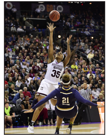
Victoria Vivians led Mississippi State to second-place finishes in 2017 and 2018.