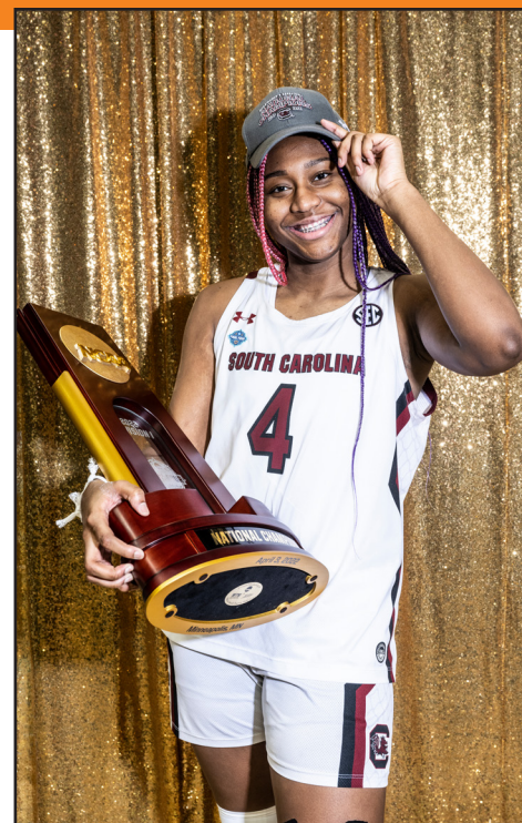
2022 Most Outstanding Player Aliyah Boston of South Carolina.