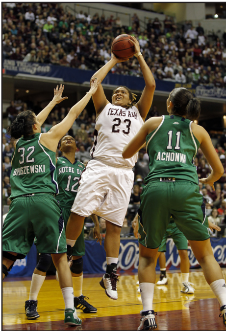
Danielle Adams scored 30 points in the 2011 championship game as Texas A&M won its first national title.