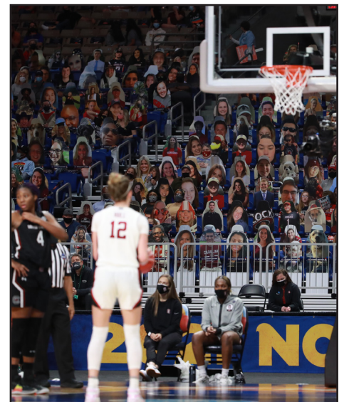
Stanford's Lexie Hull was perfect from the free-throw line in the Cardinal win over the South Carolina Gamecocks during the 2021 Women's Final Four.

19—UConn, 2013 17—Stanford, 2021 16—Notre Dame, 2001 14—UConn, 2000 14—Baylor, 2019 13—Duke, 2006 13—UConn, 2015 13—South Carolina, 2017 12—Tennessee, 1989