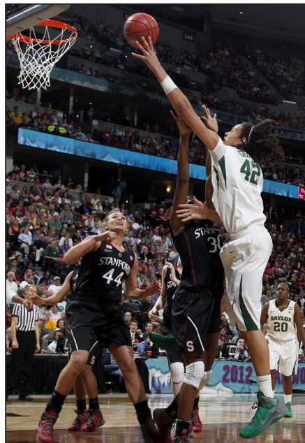
Brittney Griner of Baylor scored 26 points and had 13 rebounds in the 2012 national championship game.