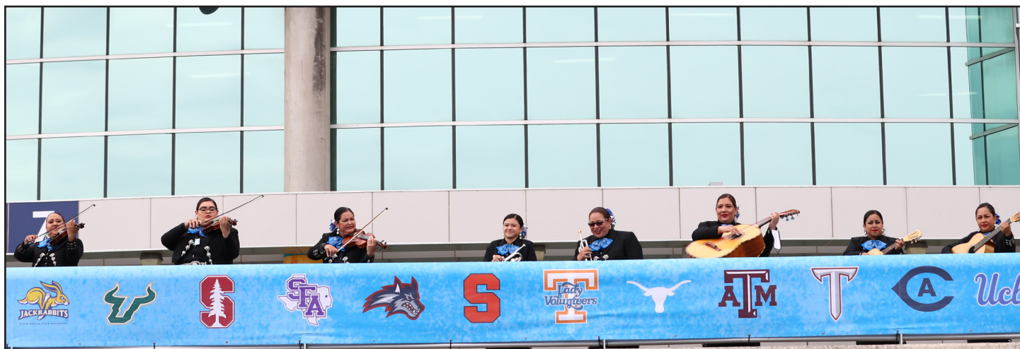
In true Texas fashion, a mariachi band serenaded the 2021 regional final teams as they entered the Alamodome in San Antonio.

The 2021 championship marked ESPN's 18th consecutive year of televising all 63 games of the NCAA Division I Women's Basketball Championship and the 26th year overall of exclusive coverage. All games were presented in high-definition television on ABC, ESPN and ESPN2.