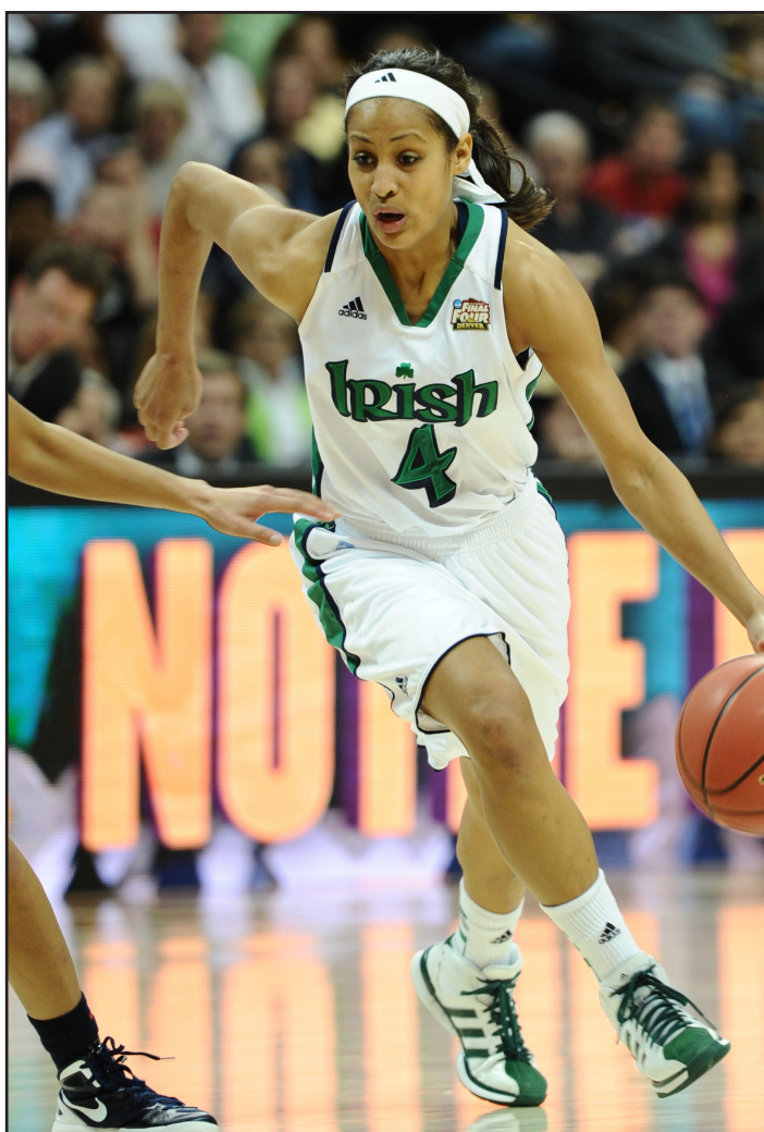
Notre Dame's Skylar Diggins had a career total of 102 assists from 2011-13.