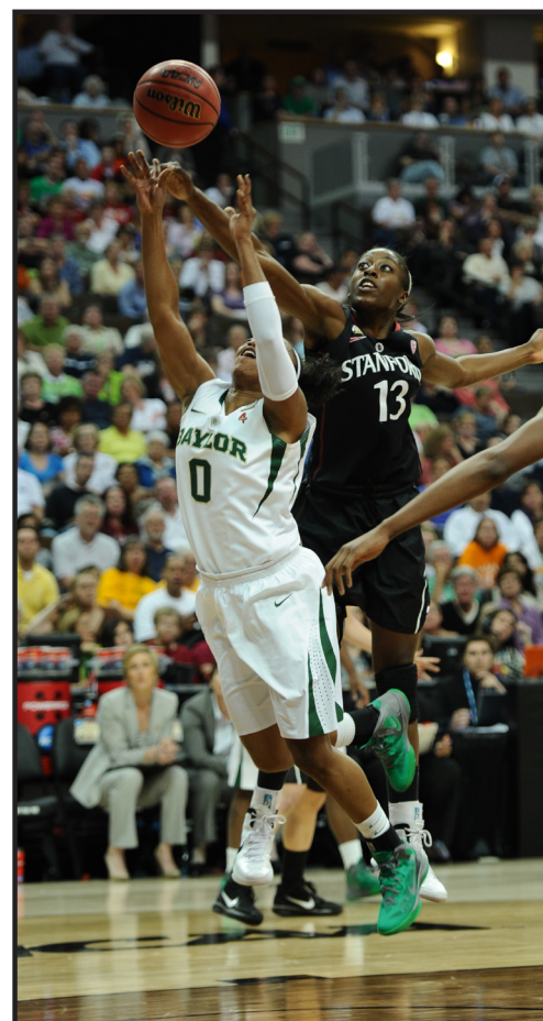
Guard Odyssey Sims (0) of Baylor takes a shot while Chiney Ogumike (13) of Stanford attempts to block it during the Women's Final Four semifinals at the Pepsi Center in Denver in 2012. Baylor defeated Stanford 59-47 to advance to the championship final.

Villanova 81, South Dakota St. 74 Notre Dame 1st, March 16 Mississippi St. 73, Louisville 63 NSF, March 30 Notre Dame 91, UConn 89 NSF, March 30