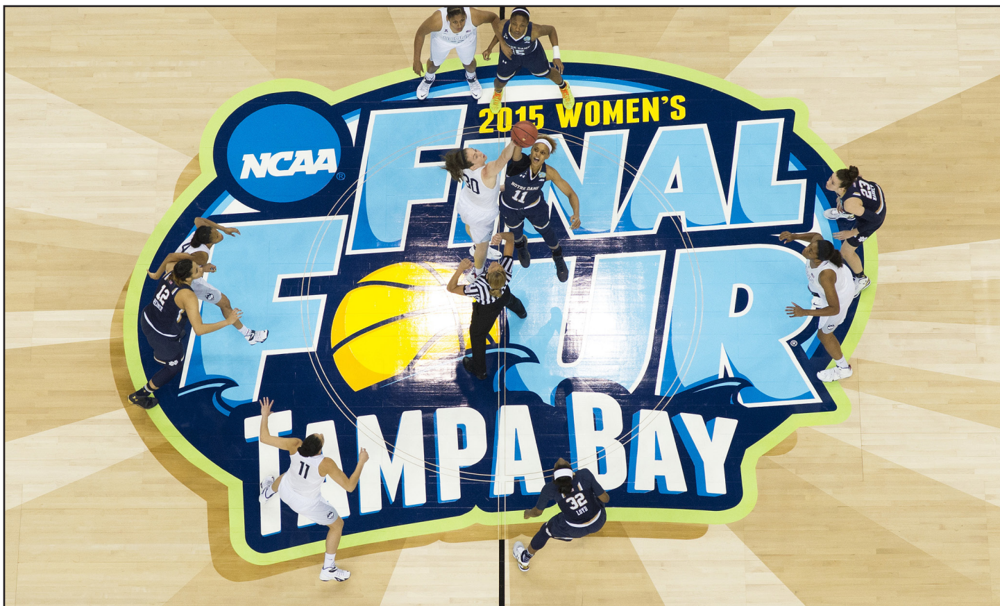
Amalie Arena in Tampa Bay has played host to the Women's Final Four in 2008, 2015 and 2019. Tampa Bay will host again in 2025.

Crowds of 19,730 and 19,810 attended the two sessions.