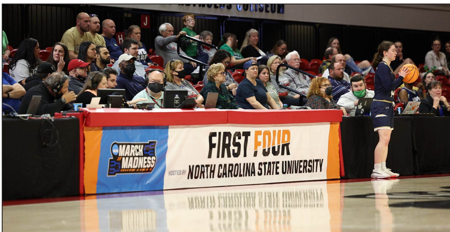
2022 saw teams competing in the inaugural First Four. Games were held at Iowa State, LSU, NC State and South Carolina.

The title capped a season in which Stanford played through much adversity due to the COVID-19 pandemic, that included not having the luxury of playing on its home court for long stretches of the regular season. It also capped a championship that was played entirely in the San Antonio region due to the pandemic, with six championship rounds featuring 63 games played using five venues and six courts in and around San Antonio that included the Alamodome, Bill Greehey Arena on the campus of St. Mary's (Texas) and the UTSA Convocation Center in San Antonio, Texas' Frank Erwin Center in Austin, Texas, and Strahan Arena on the campus of Texas State.