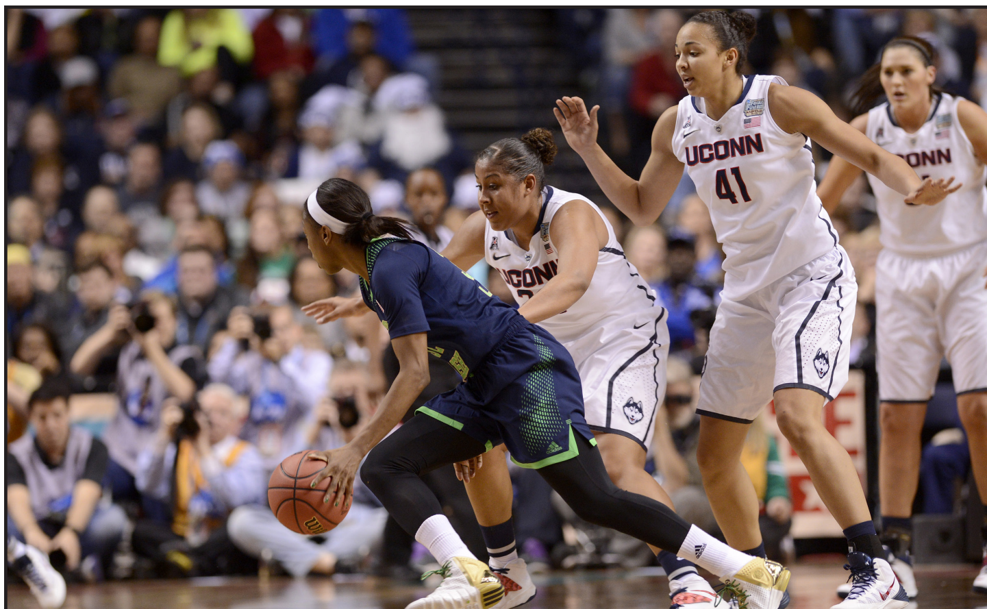
The 2014 national championship game featured two undefeated teams in UConn and Notre Dame and drew a 2.8 rating on ESPN.

2008 The championship bracket remained at 64 teams, with 31 eligible conferences awarded automatic qualification.