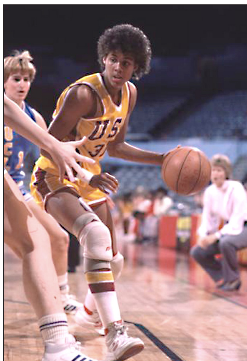
Cheryl Miller of Southern California led her team to the 1983 and 1984 national championships.