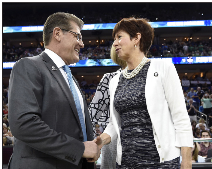
Geno Auriemma, UConn, and Muffet McGraw, Notre Dame, before the 2015 title game.