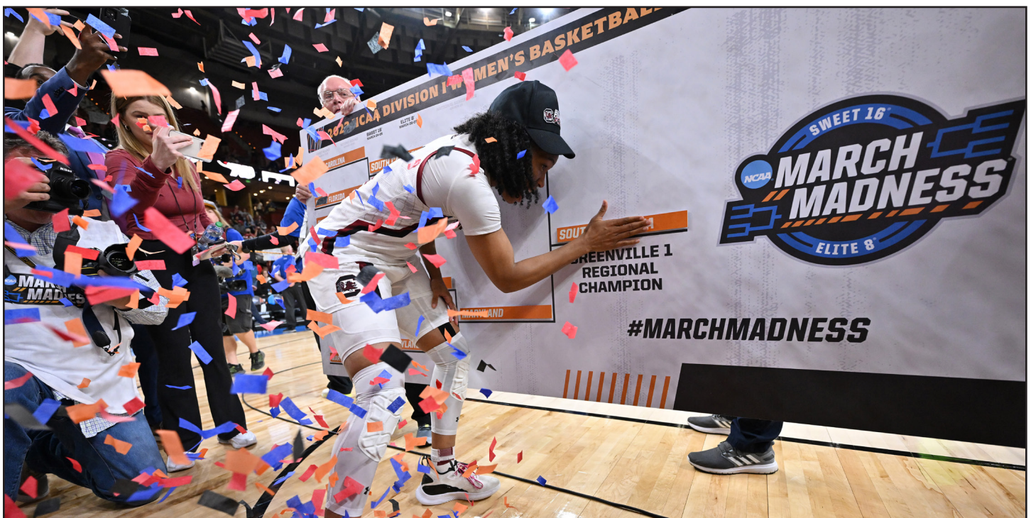
The 2023 South Carolina Gamecocks after punching their ticket to the Women's Final Four in Dallas.