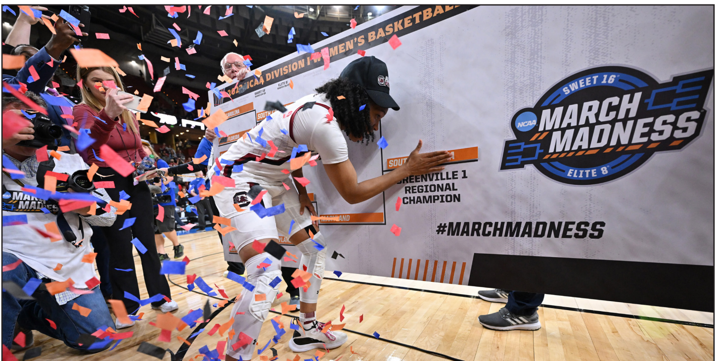
The 2023 South Carolina Gamecocks after punching their ticket to the Women's Final Four in Dallas.

The NCAA Radio Network (Westwood One Sports Radio) also broadcast the regional rounds and Women's Final Four, with the games also broadcast live by SiriusXM Satellite Radio.