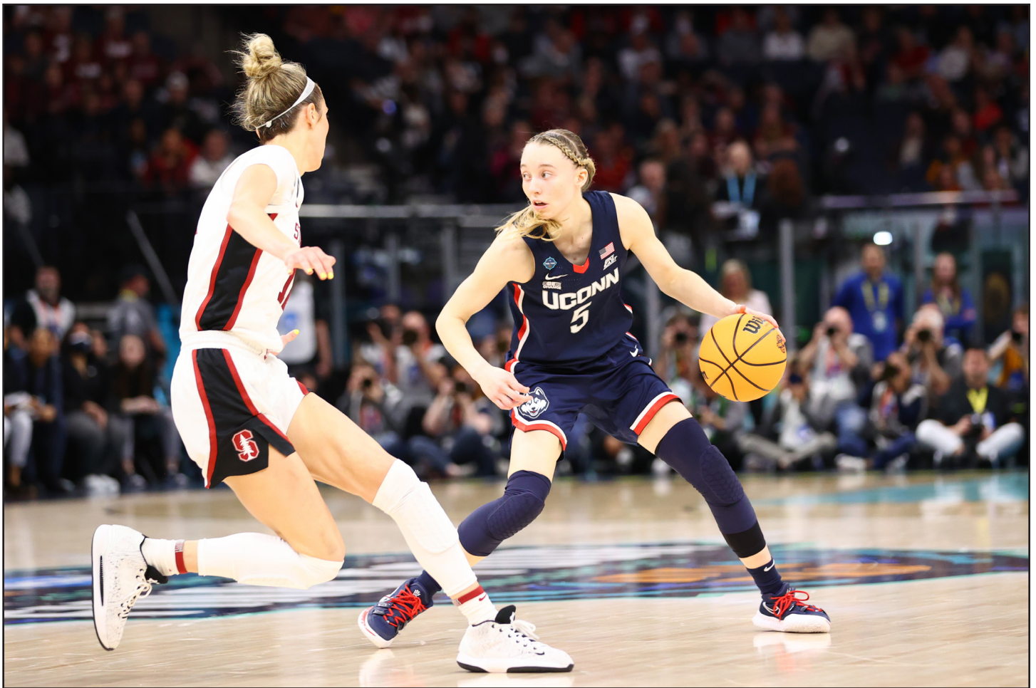
Paige Bueckers of UConn and Lexi Hull of Stanford during the 2022 Women's Final Four.