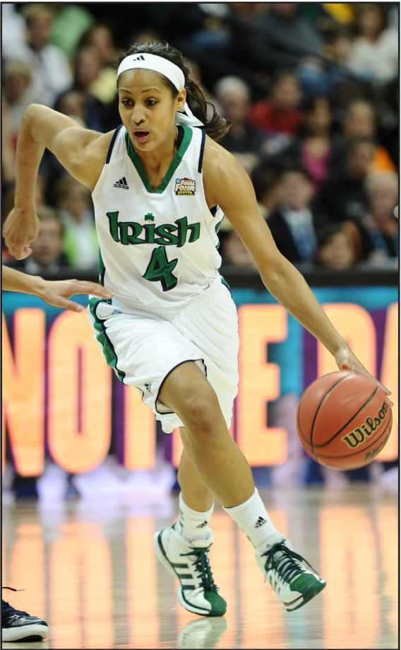
Notre Dame's Skylar Diggins had a career total of 102 assists from 2011-13.