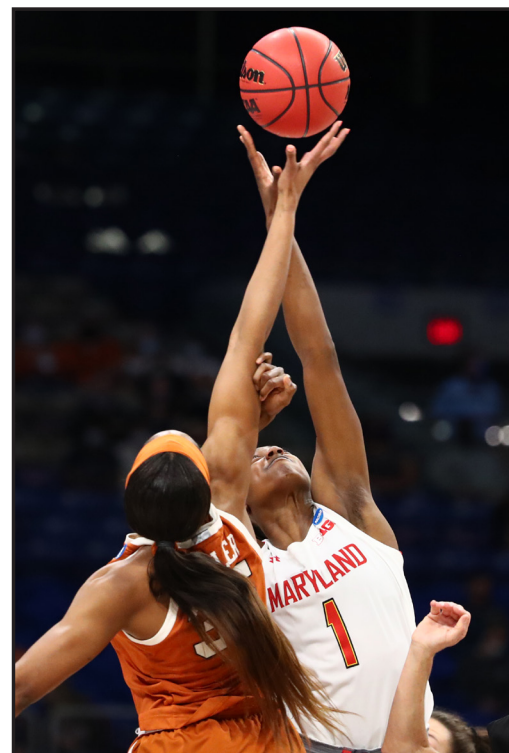
Texas and Maryland face off during the 2021 Hemisfair Regional semifinals on March 28, 2021.