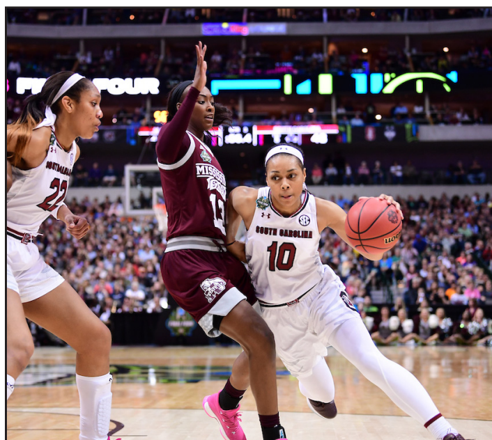
South Carolina's Allisha Gray (10) drives to the basket during the 2017 Women's Final Four in Dallas.