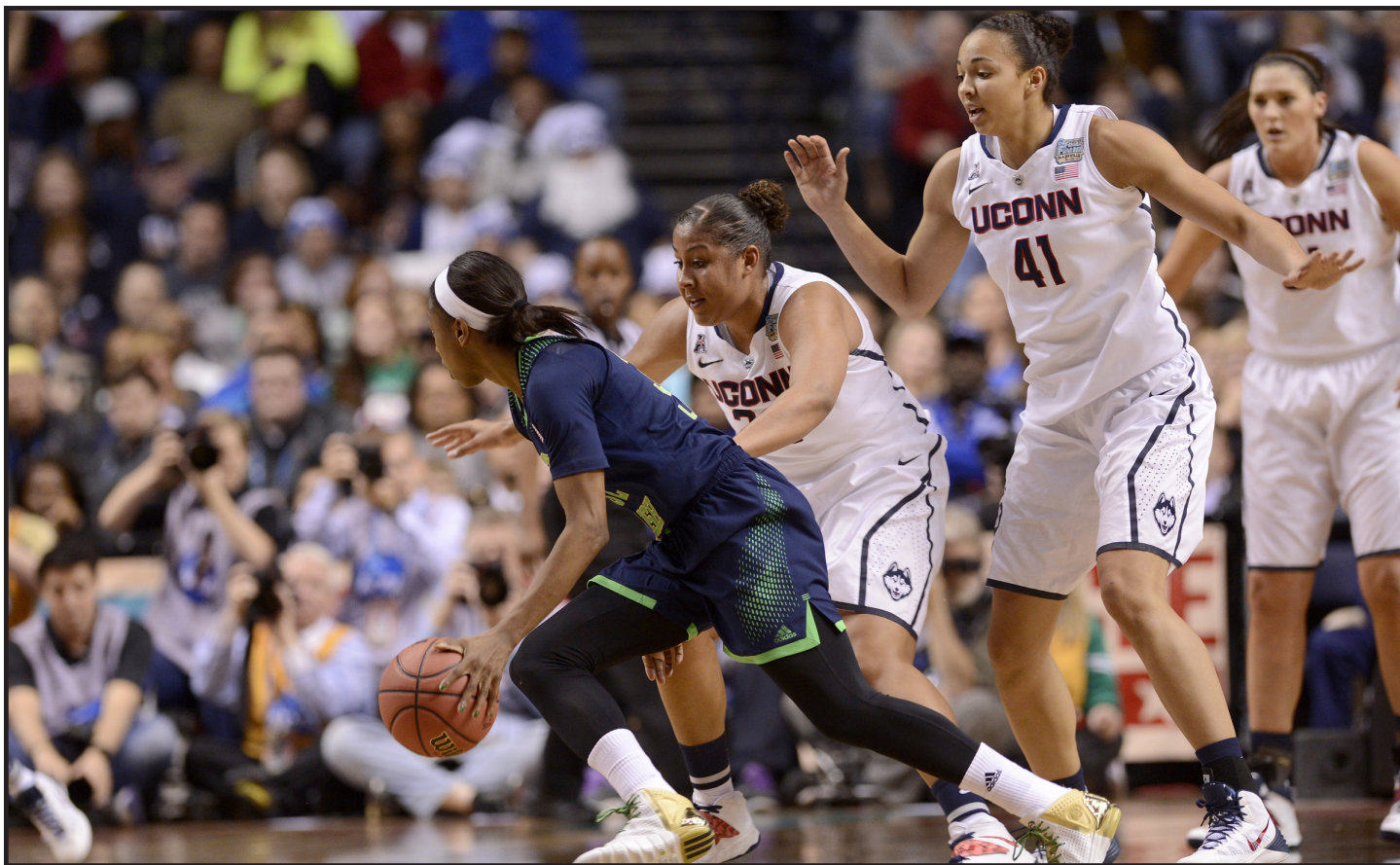
The 2014 national championship game featured two undefeated teams in UConn and Notre Dame.

In September, the Division I Championships/Competition Cabinet approved the Women's Basketball Committee's proposals to conduct regional sessions of the tournament at neutral sites and for regional bid specifications to include the opportunity for a host to bid for one year or two consecutive years, beginning with the 2007 championship.