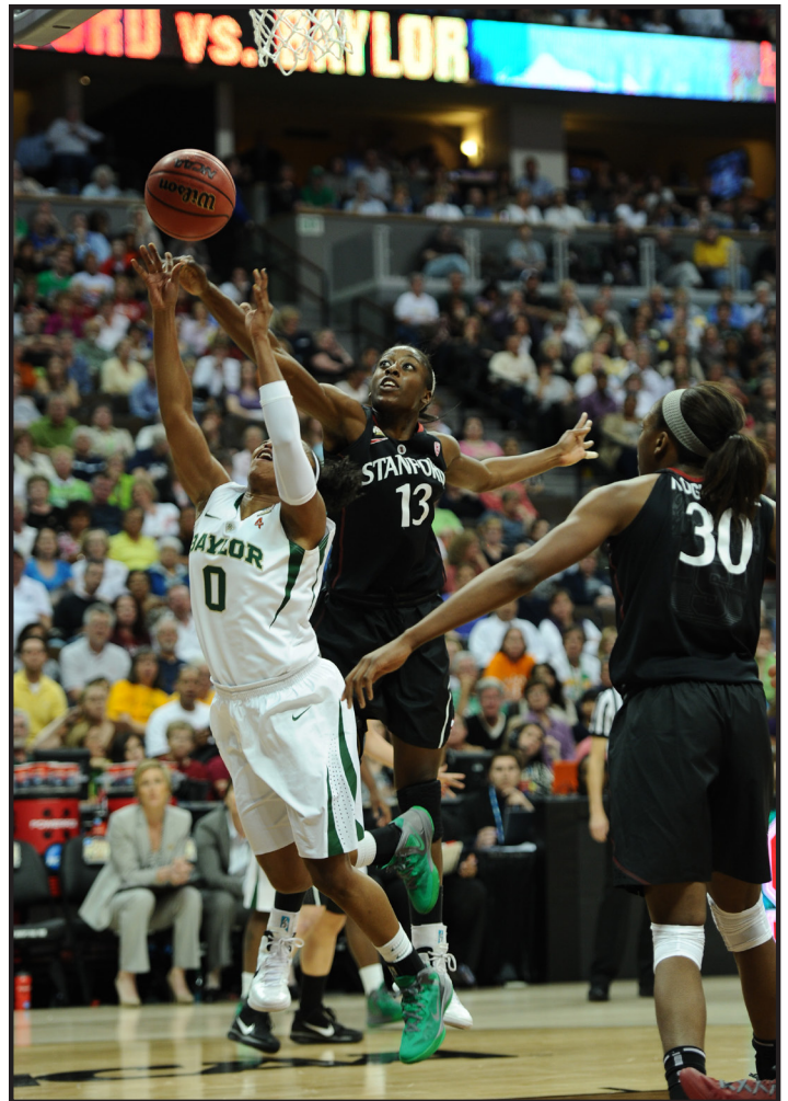
Guard Odyssey Sims (0) of Baylor takes a shot while Chiney Ogwumike (13) of Stanford attempts to block it during the Women's Final Four semifinals at the Pepsi Center in Denver in 2012. Baylor defeated Stanford 59-47 to advance to the championship final.