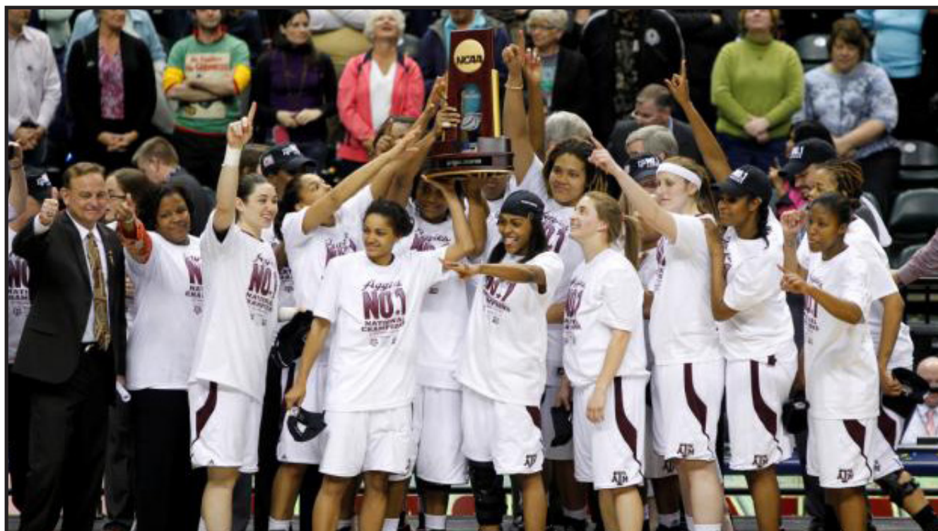
Texas A&M, 2011 national champions.