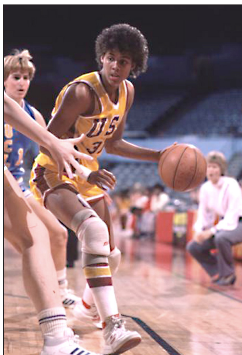
Cheryl Miller of Southern California led her team to the 1983 and 1984 national championships.