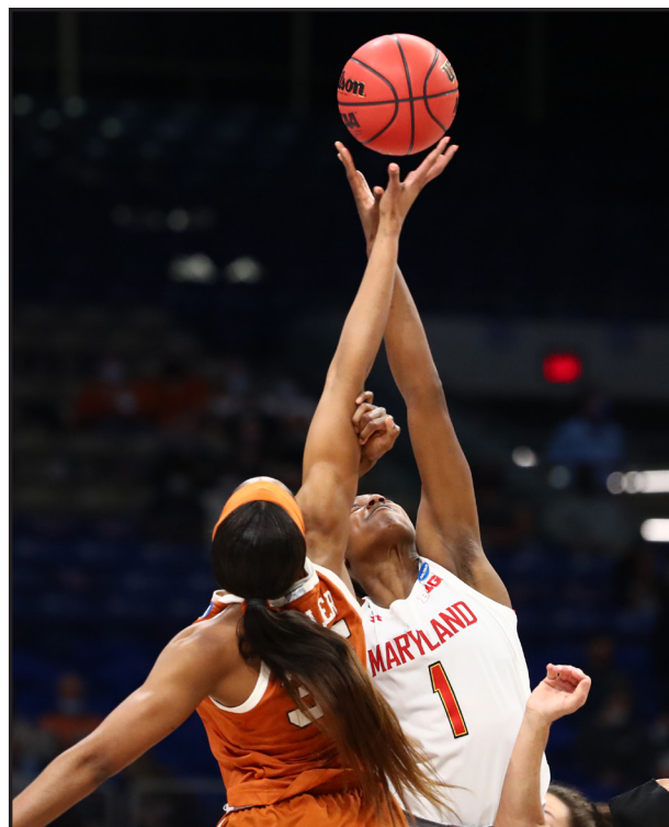
Texas and Maryland face off during the 2021 Hemisfair Regional semifinals on March 28, 2021.