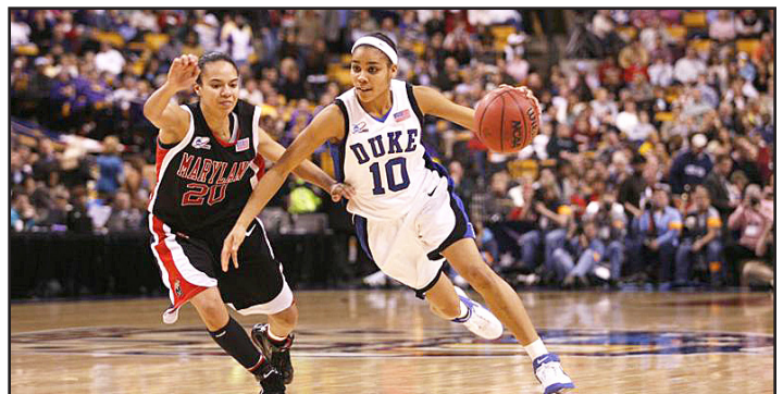
The 2006 Division I Women's Basketball Championship game between Maryland and Duke averaged a 3.1 household rating.