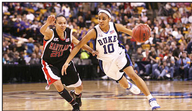
The 2006 Division I Women's Basketball Championship game between Maryland and Duke averaged a 3.1 household rating.