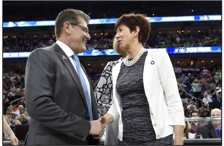
Geno Auriemma, UConn, and Muffet McGraw, Notre Dame, before the 2015 title game.